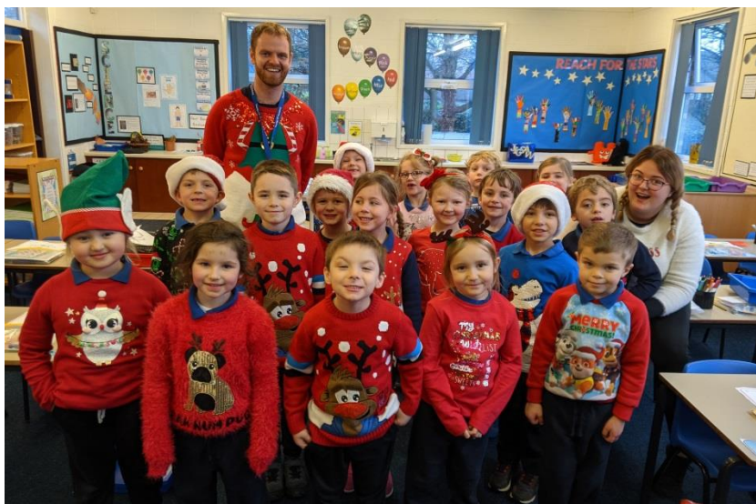
Year 1 looking wonderfully festive!

Thank you to all our children for taking part in our Christmas Jumper Day to raise money for the Save the Children charity. We will update you on how much we raised in next week's newsletter.