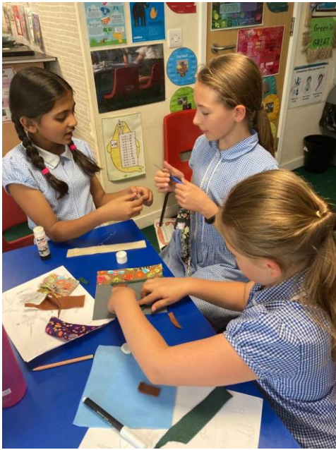
Year 4 enjoying craft activities at Westfield