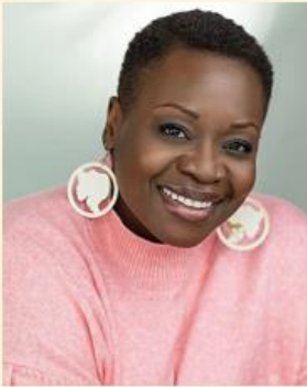
Onyeka was the Waterstones Book of the Month in June 2022.