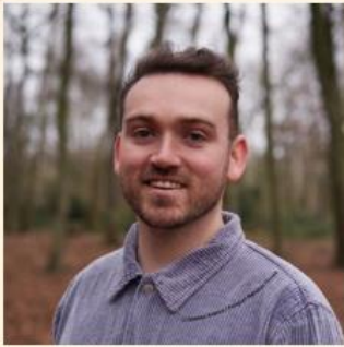
Waterstones Book of the Month March 2022.