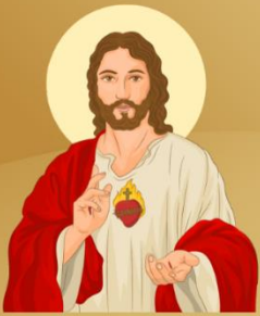
KING OF KINGS