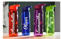
Plastic Water Bottle

A stylish cooking essential and a great way to add a personal touch to your kitchen. Printed with your child's design and can be personalised with a message, making a thoughtful gift. Size: 58cm x 42cm.