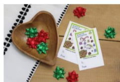
Gift Tags & Bows

A personalised solid ceramic mug is unique gift idea for any tea or coffee lover. Size: 8cm diameter with a 320ml capacity. Gift wrap option available.