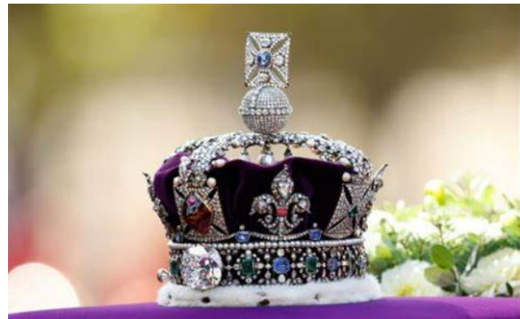
State Crown 1kg