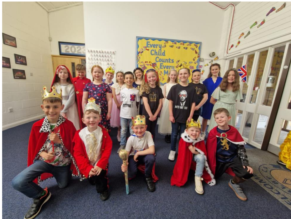
The children enjoying their traditional games: