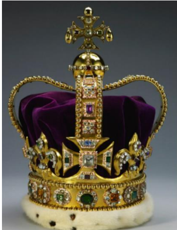
St Edward's Crown 2kg 155g

The State Crown weighs 1kg but we were amazed to find out that the St Edward's Crown weighs 2kg 155g. We took it in turns to lift that exact mass and we could not believe how heavy it felt. No wonder King Charles only wears it for a very short time!